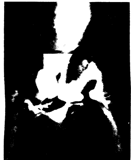
Fig. 4(A): CT dissecting abdominal aortic aneurysm with partial mural wall thrombosis. (B): Transaxillary abdominal aortogram of the same patient in (A) showing fusiform abdominal aortic aneurysm with delayed filling of the dissecting sac.