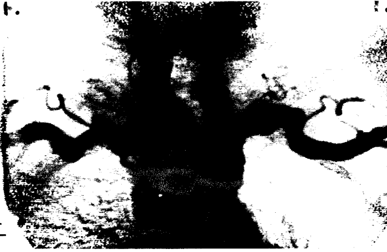
Fig.1(A): Arch aortogram Multiple aneurysm and kinks of both subclavian arteries only 0.028 J guide wire succeed to enter the aortic arch because of advanced kinking and tortuosity.