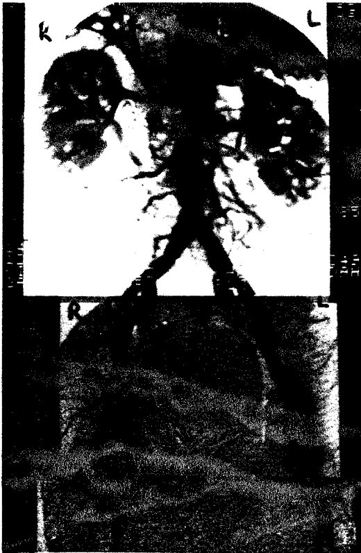
Fig.1(B) Distal abdominal and lower limb arteriography for the sample patient in (A) showing multiple abdominal, external iliac and femoral aneurysms, Note the large fusiform aneurysms of both femoral arteries that make trans-femoral approach hazards.