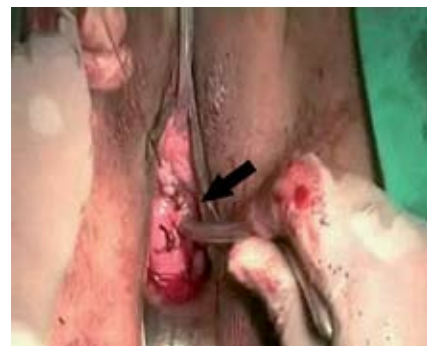
Figure 4 - Patency of the cervix is confirmed.