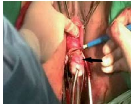
Figure 2 - The cervix is amputated.